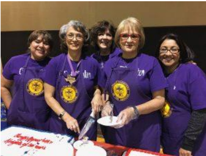
Catholic Daughters of America at Holy Spirit assisted Assembly 2799.