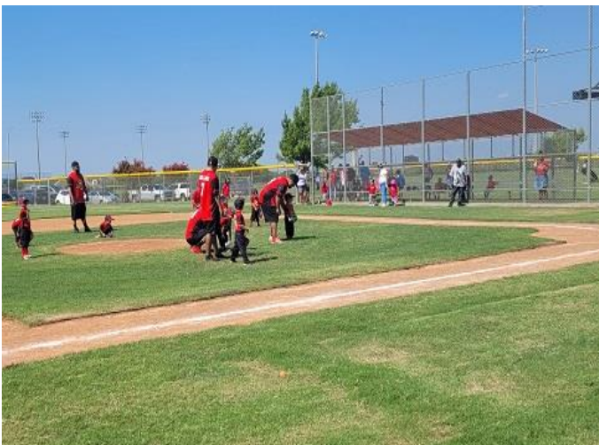
The sights and sounds of Baseball