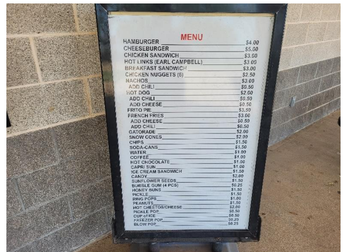
The full Menu