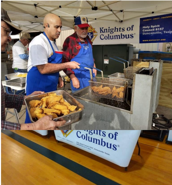
Holy Spirit Catholic Church – Duncanville, Tx,